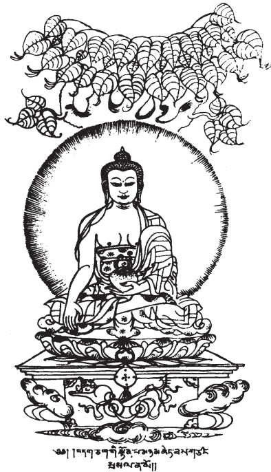
Shakyamuni Buddha Drawing by Lama Zopa Rinpoche

Thub tshül chhang zhing jam gön gyäl wäi tän Dzin kyö pel wä kün zö dog por dzä Chhog sum kur wäi leg mön thu drub pa Dag sog dül jäi gön du zhab tän shog