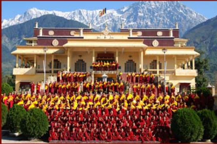
Gyuto Trantic Monastery, India