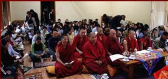
Monks with the Tibetan community