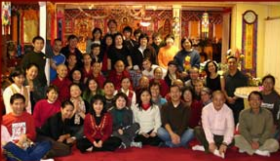
Teachings by Dhakpa Rinpoche