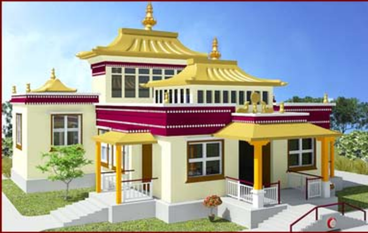
Artist's rendering of proposed main prayer hall