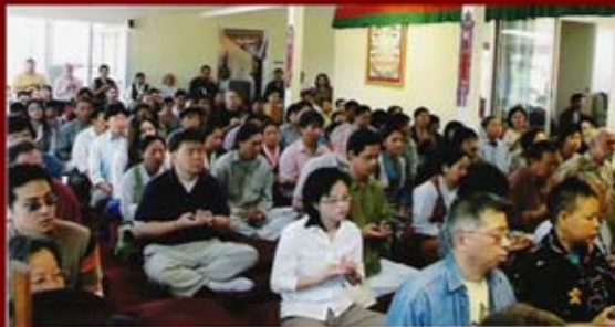
Teaching at the Gyuto Center

The Gyuto Vajrayana Center is a 501(c)3 religious non-profit organization registered in the State of California. Thank you for your support of the Gyuto Center Monastery Project.