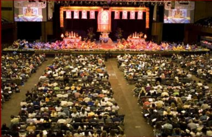
H.H. the Dalai Lama's teachings in 2007 hosted by Gyuto Center