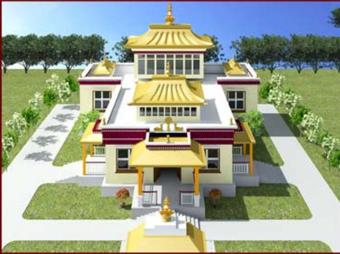
Artist's renderings of proposed monastery

As a result of the successful outreach efforts of the Gyuto monks, the Gyuto Center plans to build a permanent monastery. The Center has outgrown its current location. It has become more challenging to accommodate the growing numbers of students and interested members of the community. There is a great need for additional rooms for visiting teachers and monks, retreat facilities, student housing, dining facilities, and parking areas. The Gyuto monks hope to build a monastery that will accommodate all their current activities and needs, as well as a monastery that will support expanded activities in the future.