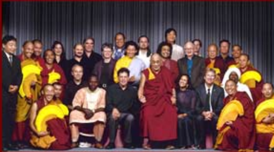
H.H. the Dalai Lama and Gyuto monks in New York