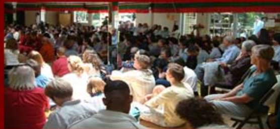
Teachings by Dhakpa Rinpoche